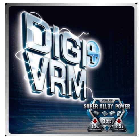
*Only partial power setting may be adjusted by software

Acclaimed DIGI+ VRM with Super Alloy Power technology delivers precise Digital Power and enhance durability for stable overclocking